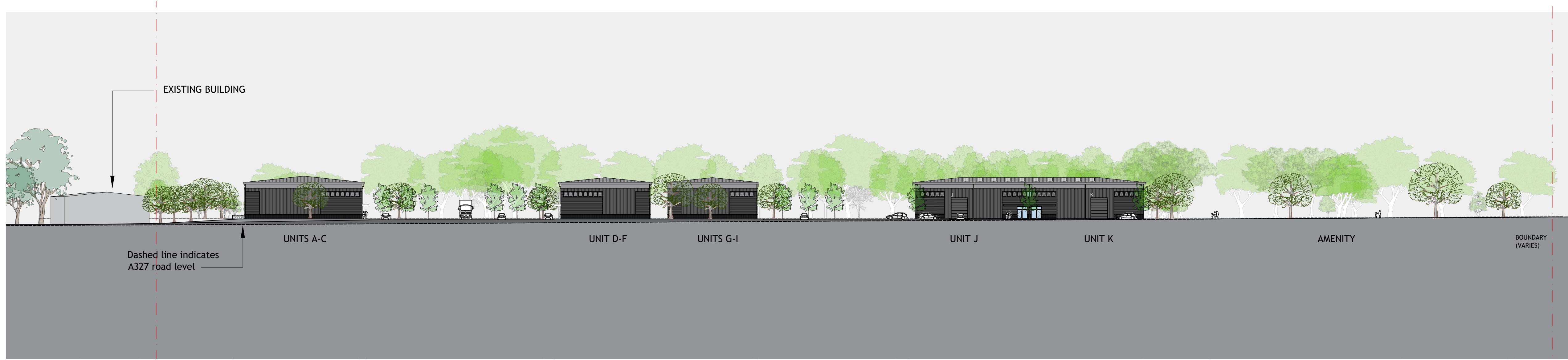
MASSING ELEVATION PROPOSED B-B SCALE 1:500